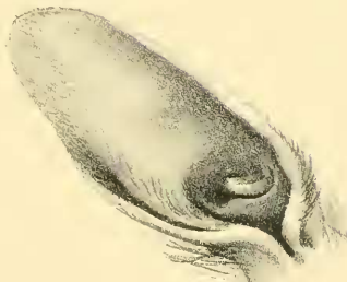
Fig. 5 x 1